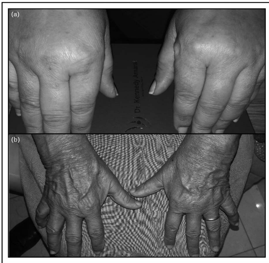
FIGURE 1. A patient with chronic chikungunya arthritis. (a) Before methotrexate treatment. (b) Following methotrexate 7.5 mg/week for 4 weeks.

In the best available CHIK arthritis MTX study, Ravindran and Alias [75 *** ] demonstrated superiority of triple therapy (MTX 15 mg/week, HCQ 400 mg/day, and SSZ 1 g/day) compared with HCQ